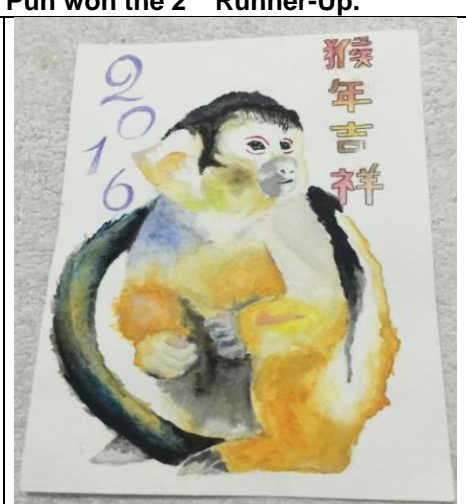
潘倩琪Michelle PUN 2<sup>nd</sup> Runner up